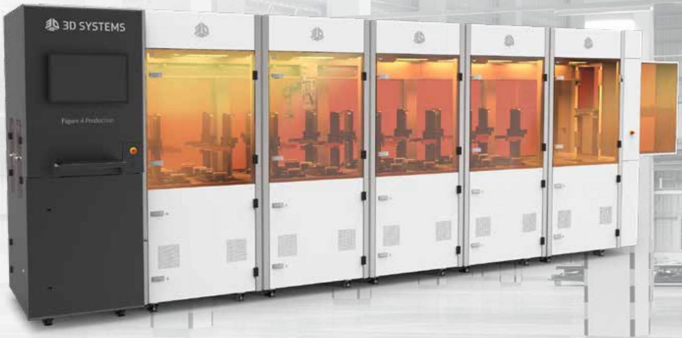
Figure 4 Production combines the design flexibility of additive manufacturing in configurable, in-line production cells to deliver a customizable and automated direct 3D production solution.

Industry's first customizable, fully-integrated factory solution for direct digital production