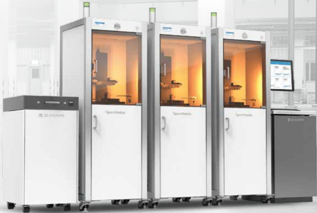
Figure 4 Modular is a scalable, semi-automated 3D production solution that grows with your business, enabling capacity to meet your present and future needs, up to 10,000 parts per month, for unprecedented manufacturing agility.

Scalable, semi-automated 3D manufacturing solution designed to grow with your prototyping and production needs